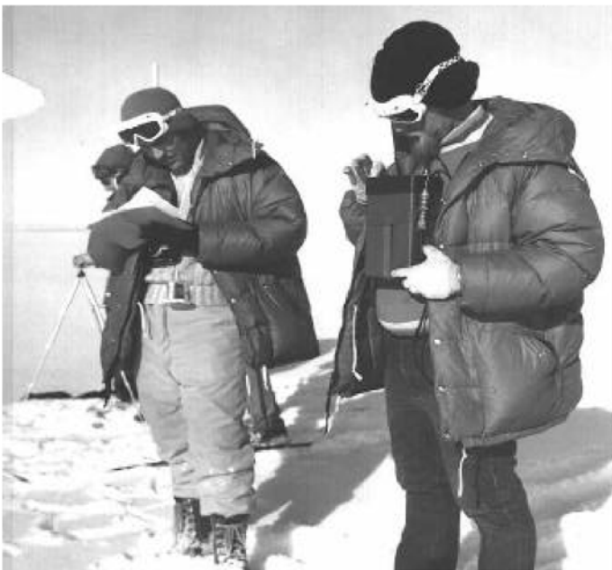
G-856AX Arctic Survey

The G-856 provides a reliable, low cost solution for a variety of magnetic search and mapping applications. Single key stroke operation means the G-856AX can be operated by non-technical field personnel or used in teaching environments. The G-856AX uses the established proton precession method, allowing accurate measurements to be made with virtually no dependence upon variables such as sensor orientation, temperature, or location. The