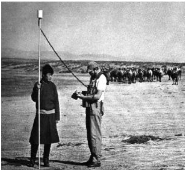
G-856AX Desert Survey in Tibet

A thoroughly well proven design (over 2,600 units sold), excellent performance and the lowest price professional system are key features of the G-856AX. Combined with the ease of use, user friendly download/editing software, and readily available commercial contouring programs, the G-856AX represents a complete magnetic surveying package generating high quality data for budget conscious users.